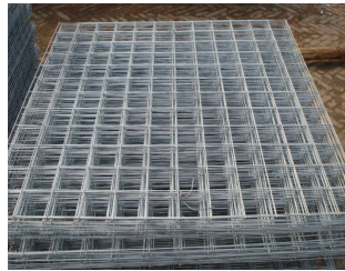
G.I. Steel Matting